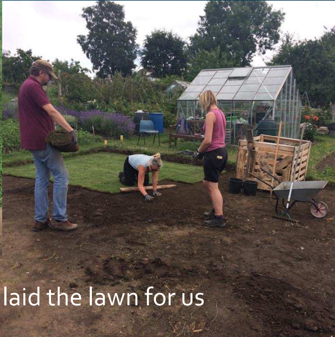
Two local gardening companies laid the lawn for us